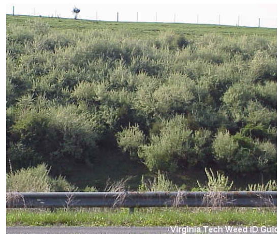
Dense growth of autumn olive.