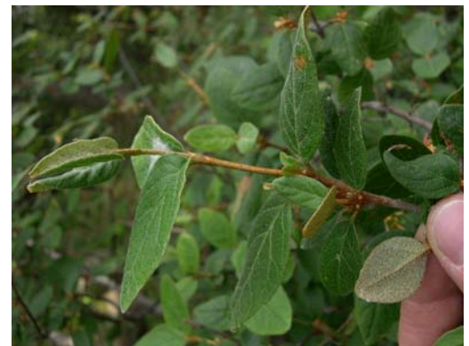
Autumn olive branch.