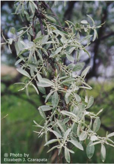
Alternate, lance-shaped leaves of Russian olive.

Bark. The thin gray bark can be peeled off in narrow fibrous strips.