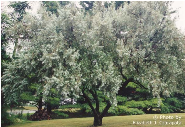
Mature Russian olive tree.

Plant Habit. This deciduous, woody species grows from 10-30 feet in height, taking the form of a large shrub or small tree.