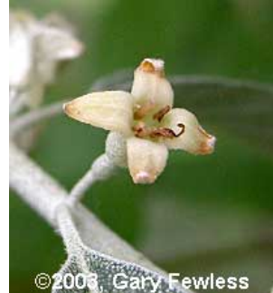
Flower of Russian olive.

Fruits/Seeds. Abundant fruits mature from August to October. They are dry and mealy, yellow or reddish-brown with a dense covering of silvery scales, and about 1/2 inch long, resembling a small olive. Fruits stay on the tree