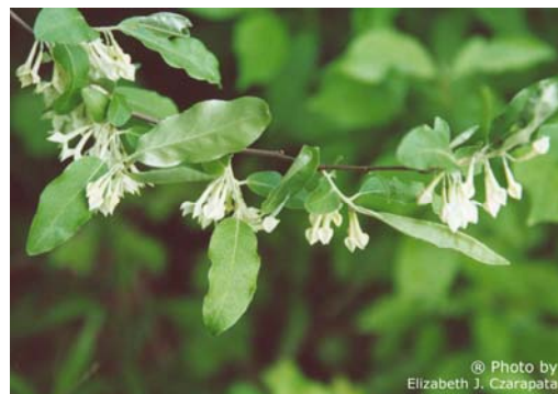
Tubular, 4-petaled flowers of autumn olive.

Leaves. Oval or elliptic with blunt points, arranged alternately along stem. Leaf edges are smooth and often wavy. Leaf size ranges from 2-4 inches long and up to 1.5 inches wide. Upper leaf surface is green to gray-green and smooth, and the underside is silvery and scaly.