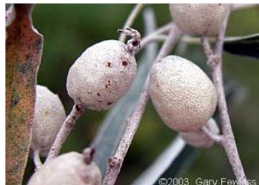
Dry, silvery fruits of Russian olive

Autumn olive and Russian olive are closely related and similar in life history and invasiveness. Reproduction is primarily by seed, but also from root-crown sprouting and suckering. Seeds can remain viable for 3 years. Although not in the legume family, both species have nitrogen-fixing root nodules and are able to tolerate infertile soils and disrupt nutrient cycles in native plant communities. Their prolific and rapid growth enable them to compete with native plants for water, light and other