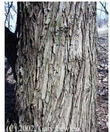
Gray, fibrous bark of autumn olive.