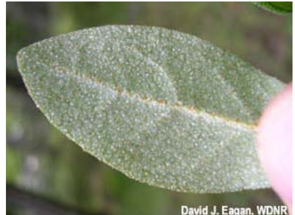
David J. Eagan, WDNR Silvery scales present on the underside of an autumn olive leaf.

Habitat. Open woods, forest edges, roadsides, fencerows, old fields, pastures, sand dunes and heavily disturbed areas such as mine spoils. Colonizes infertile soils due to its nitrogen-fixing ability. Does not do well in densely forested areas but will move into forests from roads and edges and occupy forest gaps. Rarely found in wet soils.