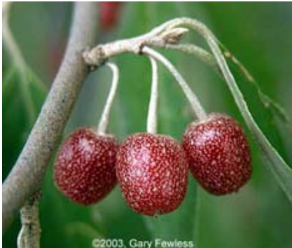
Ripe autumn olive fruits in fall.

Fruit. The small, rounded, single seeded fruit is borne on short stalks and ranges from 1/8 to 3/8-inch long and 3/16-inch wide. The fruit is silvery with brown scales in early summer, becoming juicy and yellow and ripening to a copper-speckled pink/red in fall.