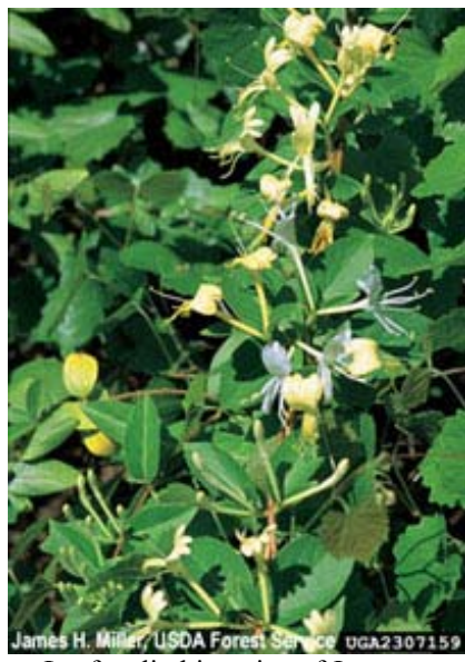
Leafy, climbing vine of Japanese honeysuckle.