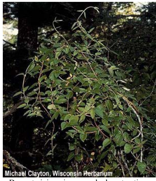
Dense twining vines can shade out natives.

On Foresters: Tangled vines may hinder access to the forest and interfere with forestry operations such as reconnaisance. Safety of sawyers felling trees is compromised as trees fall in