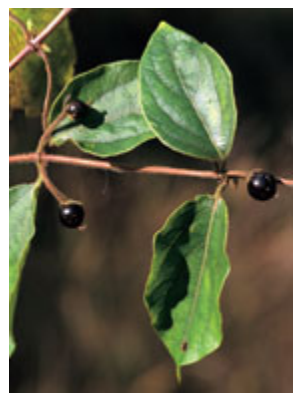
Ripe fruits are blue-black.