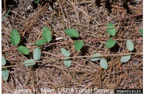
Leaves in pairs along stem, often with lighter green undersides.