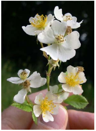
White flowers bloom in May-June

Habitat. It is found along stream banks, pastures, roadsides, savannas, forest edges and open woodlands. This plant thrives in sunny areas with well-drained soil but can tolerate a wide range of soil and environmental conditions. It is not found in extremely dry habitats or in standing water.