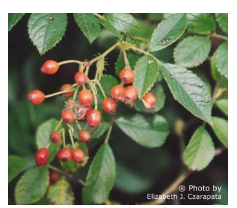
Small, hard fruits of multiflora rose