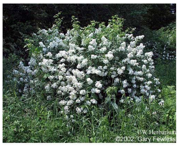
Multiflora rose in full bloom