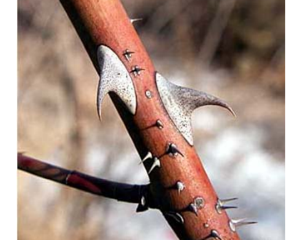
Branches have stiff, curved thorns